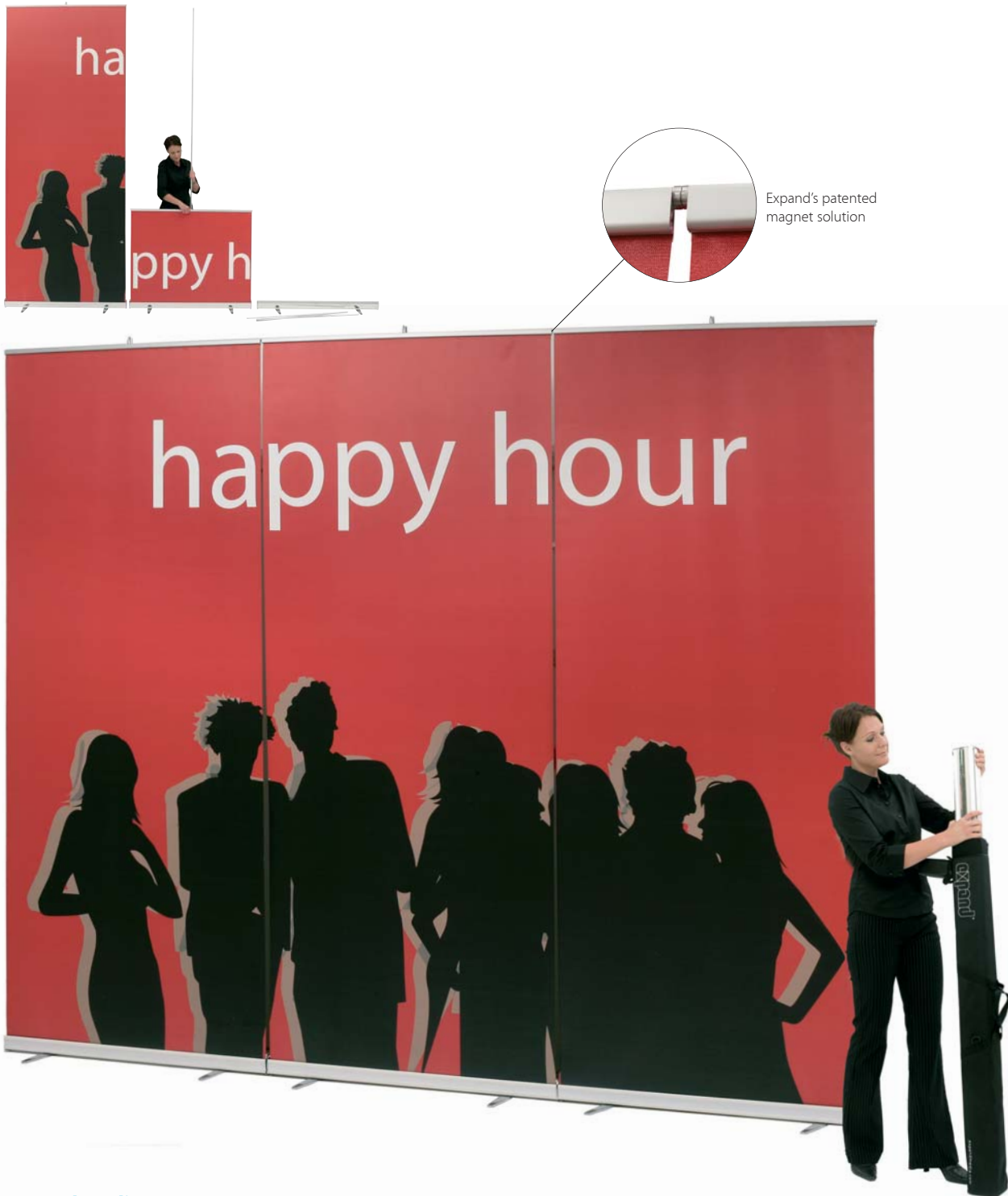
Expand's patented magnet solution